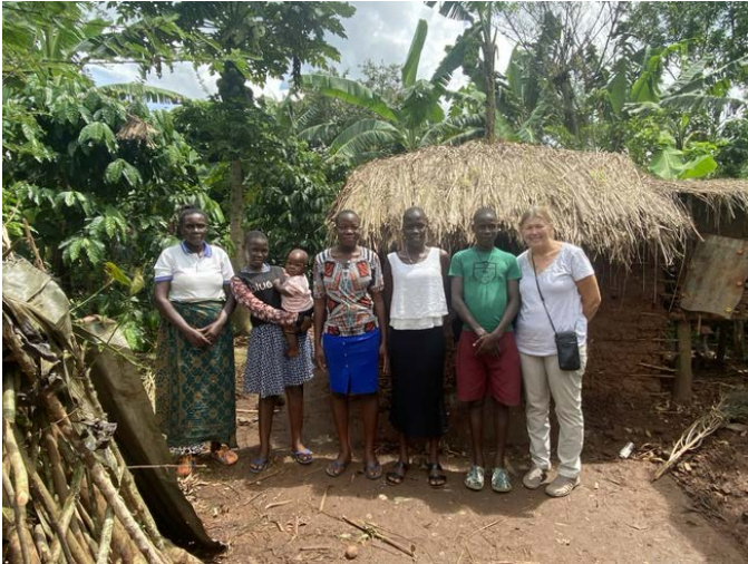
The very small hut in which the family lived