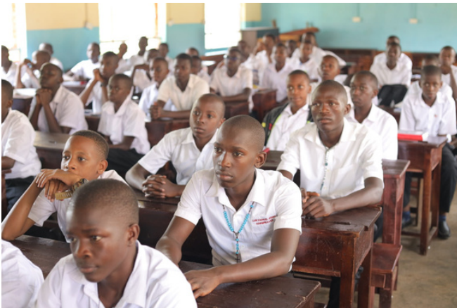
Young seminarians in class at the Nyenga Minor Seminary

We are thrilled to announce that CARITAS For Children has successfully raised the $22,000 needed to begin construction on a new water well for the Seminary in Nyenga.