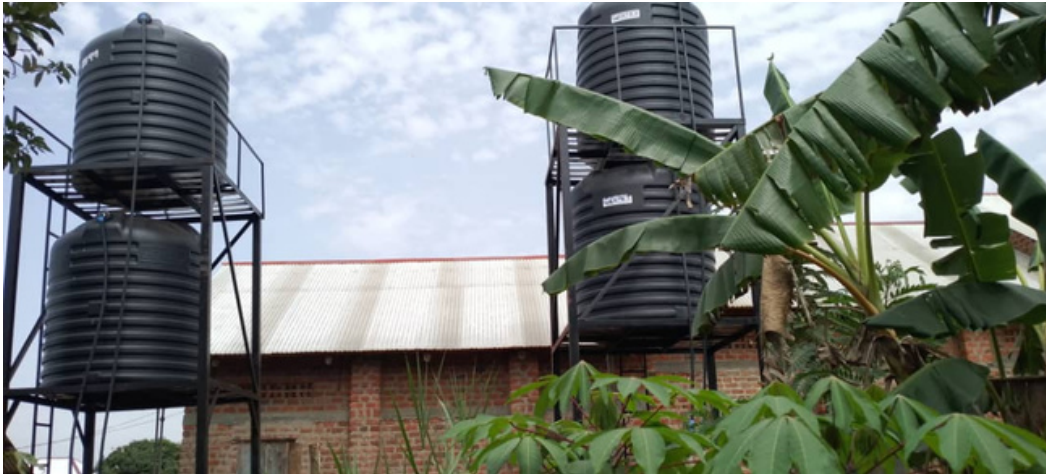
CARITAS For Children funded water wells built in 2023