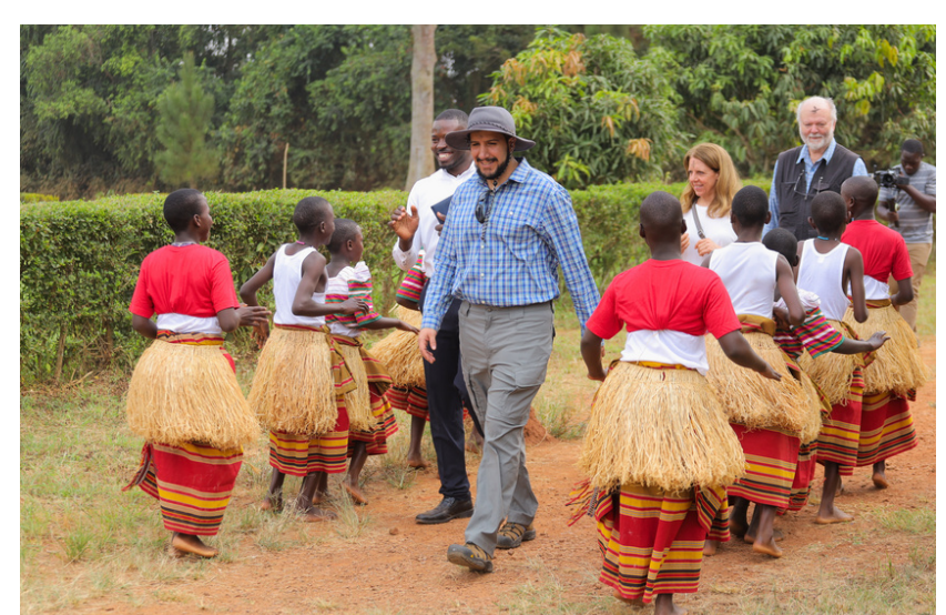
CARITAS Team being greeted by students

In the schools, we were greeted with songs, dancing, theater, and even beautiful speeches of thanksgiving. Although we know that we do not deserve such a royal welcome, it was an honor to receive it on behalf of all our CARITAS sponsors around the world.