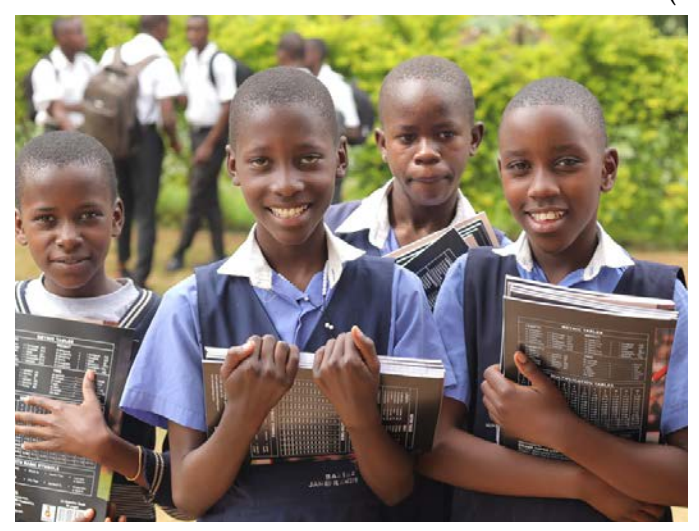
(Children getting supplies at the CARITAS House)