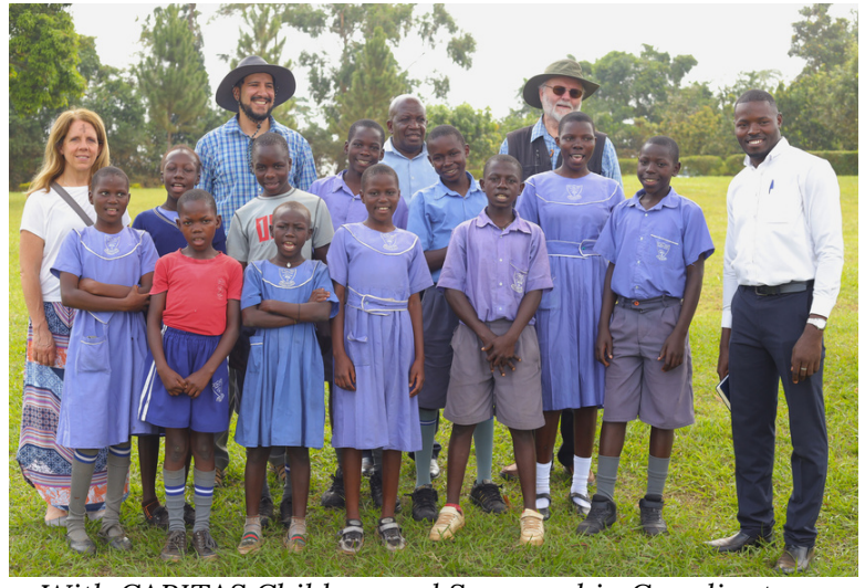
With CARITAS Children and Sponsorship Coordinators

our team in Uganda, the head teachers, and our ministry service providers. We made sure to do a full assessment to discover how they were doing and ask them about what are their main needs. We also met many of our priest friends, celebrated masses with them, and traveled to their parishes.