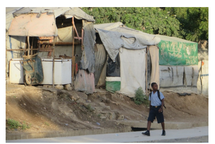
A Haitian boy walks to school.