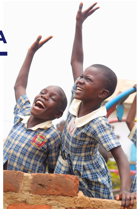
CARITAS Children during Recreation

One of our usual desires is to visit as many schools as possible to see how our ministry providers are doing and to see our children. During this trip, we were blessed to do both. There was an abundance of joy as we saw our children at school, eating, learning, smiling, and looking adorable in their school uniforms.