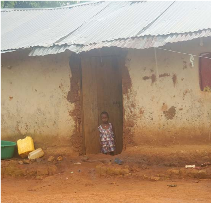
Children with no ability to go to school. These are the children we put on our website to sponsor.

nothing because they weren't able to attend school. It was very saddening but also very motivating for us as we continue to grow this ministry.