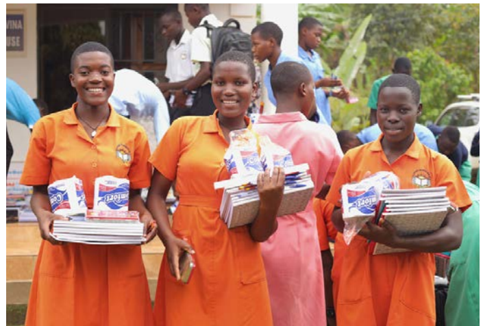
(Children getting supplies at the CARITAS House)

Many people within our organization also sponsor children and had the opportunity to see them face-to-face, some for the very first time. We also met many new children who are sponsored by CARITAS sponsors and saw firsthand the joy on their faces as they received their school supplies and toiletries for the beginning of the next trimester.