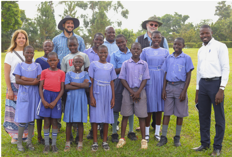
With CARITAS Children and Sponsorship Coordinators

It was also a blessing to meet with our team in Uganda, the head teachers, and our ministry service providers. We made sure to do a full assessment to discover how they were doing and ask them about what are their main needs. We also met many of our priest friends, celebrated masses with them, and traveled to their parishes.