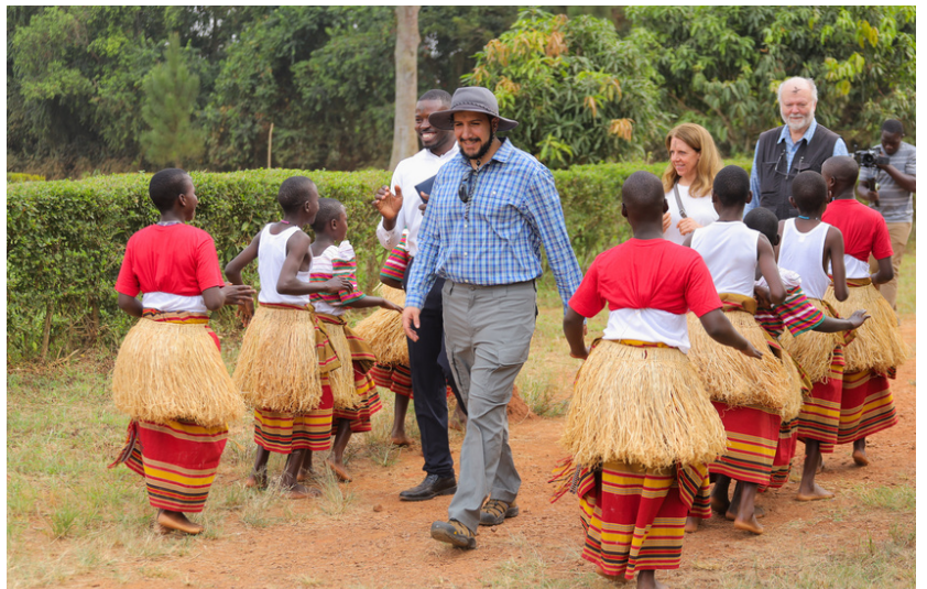
CARITAS Team being greeted by students

In the schools, we were greeted with songs, dancing, theater, and even beautiful speeches of thanksgiving. Although we know that we do not deserve such a royal welcome, it was an honor to receive it on behalf of all our CARITAS sponsors around the world.