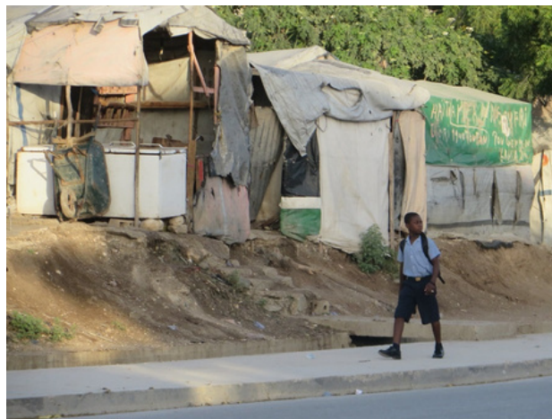
A Haitian student walks to school (photo not current)

We know that sponsors are anxiously awaiting more news about their children in Haiti. As you may know, the news stories from Haiti have not been good. The country is being torn apart by violent gangs who have severely disrupted the infrastructure and supply chains. The government is effectively paralyzed and has begun asking for foreign intervention.